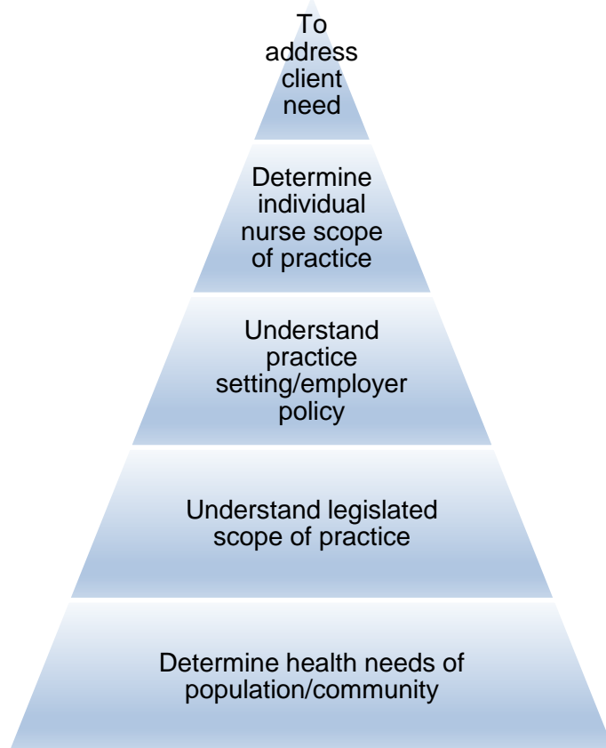
Figure 1 – Model for Assessment of Team Composition

Client Need – Client health care needs determine the breadth and depth of knowledge, skill and judgement or nurse competencies necessary for that setting.